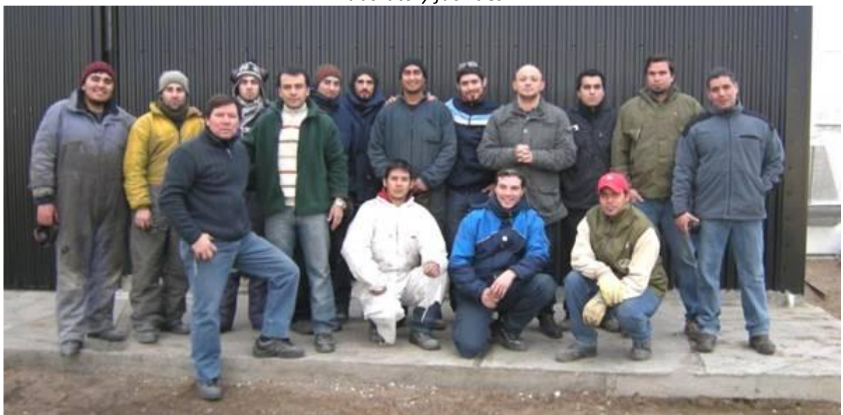
Part of the Mendoza staff that travelled to carry out this important project