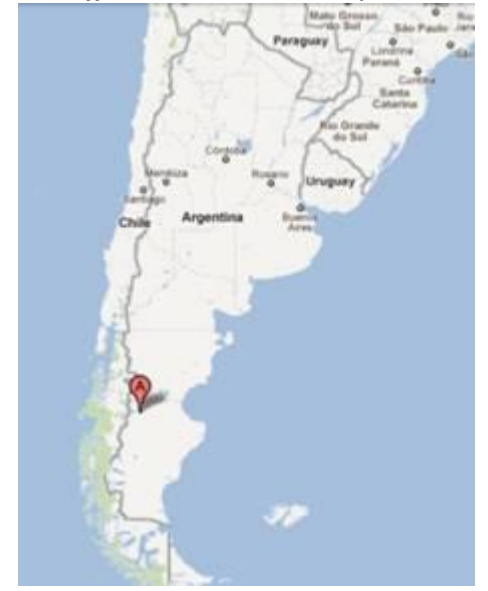
Map showing location of Perito Moreno Lab